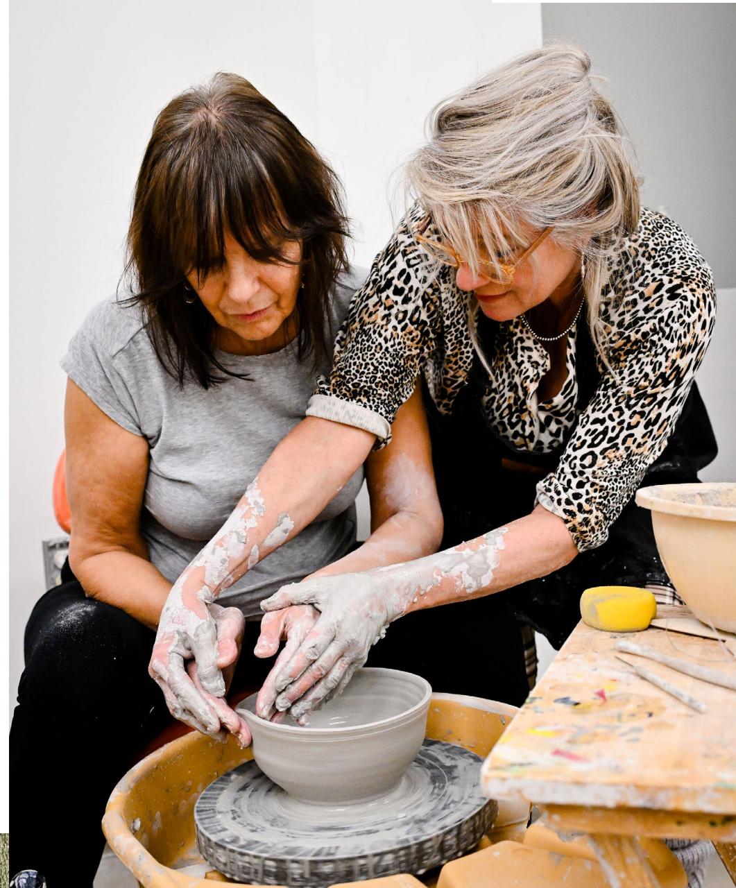
Dollard Centre for the Arts

The Dollard-des-Ormeaux community benefits from exceptional artistic wealth. Its population includes 130 professional artists , guaranteeing an inclusive and diversified cultural offering for all. In addition, its environment is filled with green spaces and ecological corridors, providing a pleasant and healthy quality of life. The future also looks