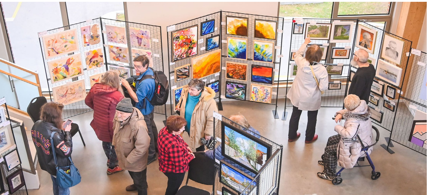
Artists' Association of Dollard's Art Exhibition

The City's rich and varied cultural programming comprises a series of activities, including shows, workshops, conferences, and more. In addition to its core programming, the cultural offerings are enriched by a community and recreational dimension, providing a range of varied activities accessible to all. Visitors can discover exhibitions at the library, take part in Literary Rendez-vous or enjoy reading outdoors with Library in the Park and the Mobile Library .