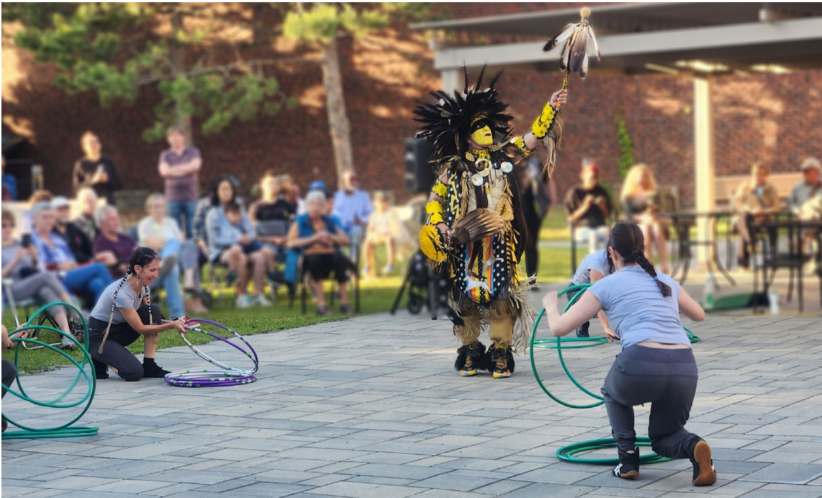
My Urban Nature by A'nó:wara Dance Theatre, June 2024

The City is a member of the Association des diffuseurs culturels de l'Île de Montréal (ADICIM). By working together, particularly with neighbouring municipalities, members avoid competing in programming, and