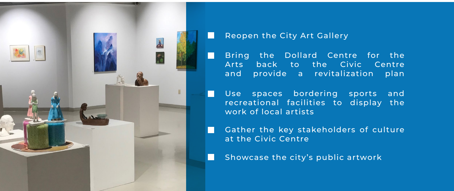
City Art Gallery