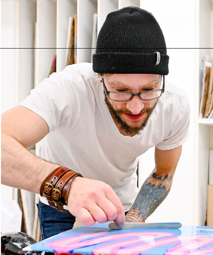
Dollard Centre for the Arts