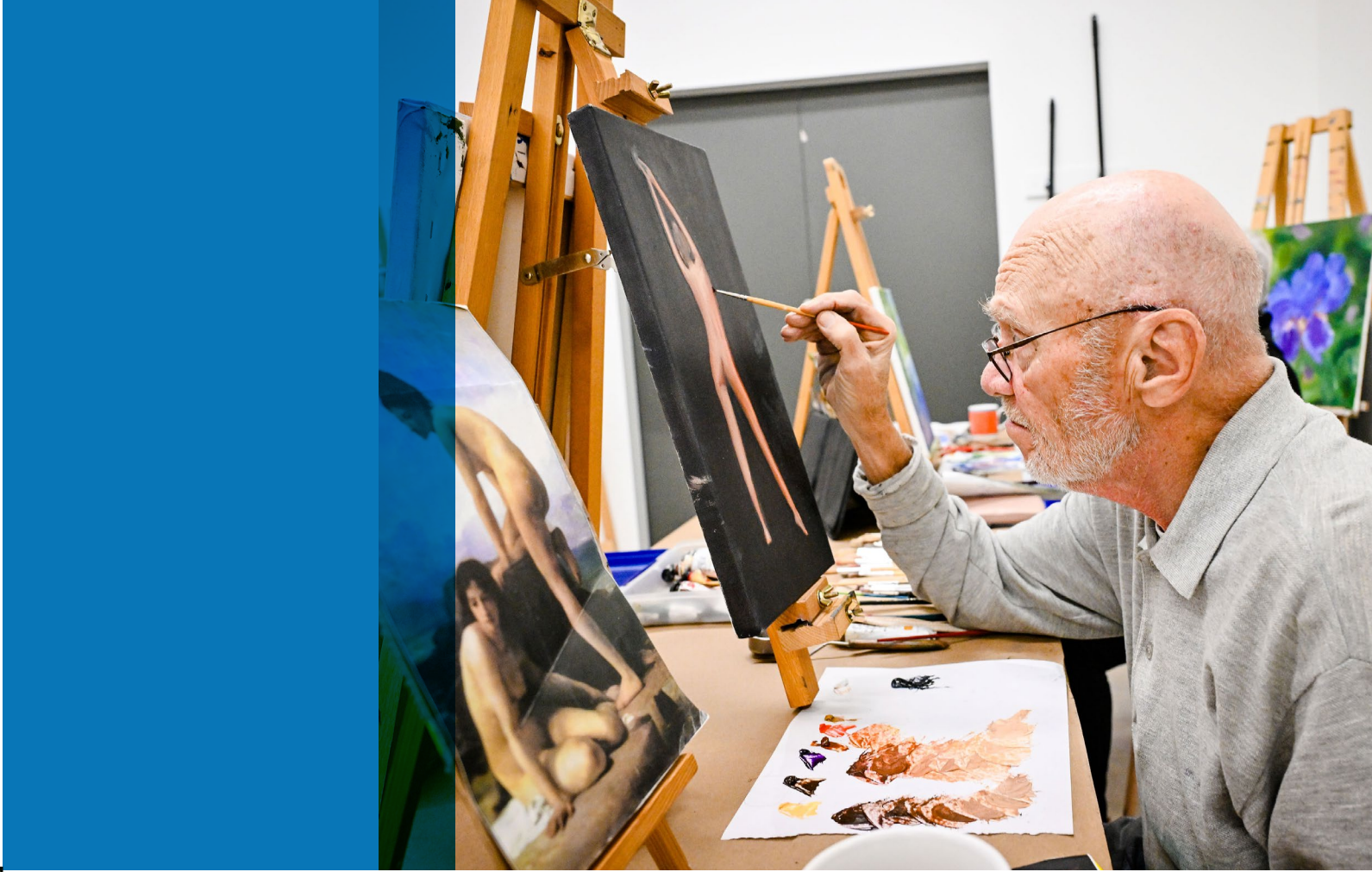
Dollard Centre for the Arts