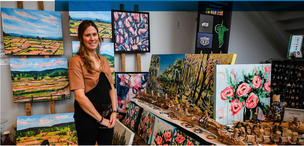
Fine Arts and Crafts Market