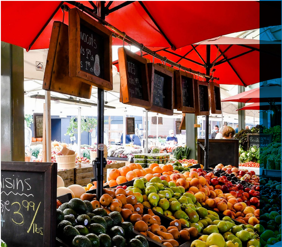
Marché de l'Ouest

The UNESCO 1982 Mexico Declaration on Cultural Policies defines culture as the distinct spiritual, material, intellectual, and emotional features characterizing a society. It encompasses arts, lifestyle, human rights, value systems, traditions, and beliefs. Culture shapes individuals and societies, fostering unity through shared values and traditions.