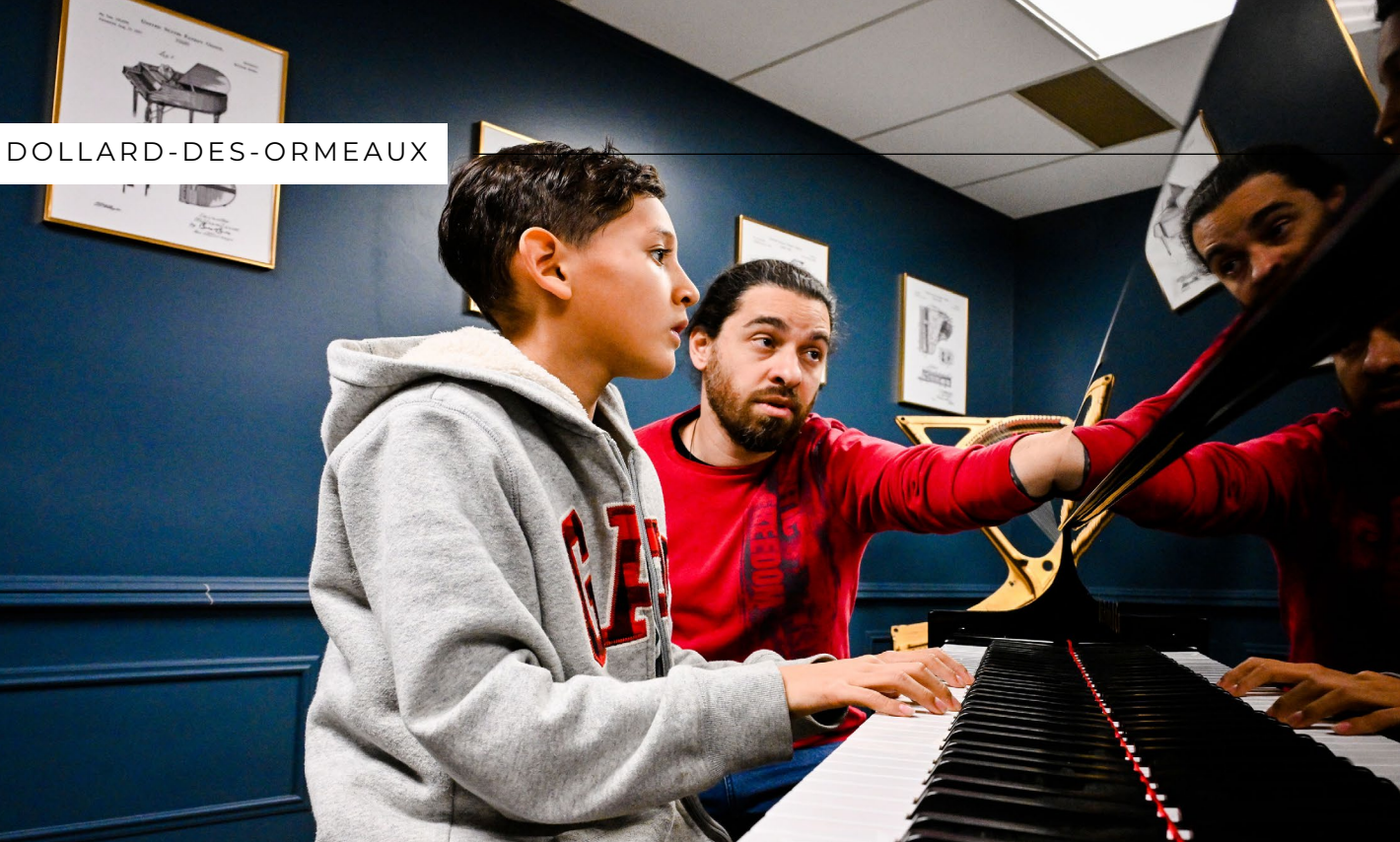
Dollard Centre for the Arts

Dollard-des-Ormeaux boasts a rich artistic presence. It is home to 130 people whose main source of income is the arts, representing 0.5% of its working population. More than half of these (70) are active in music and