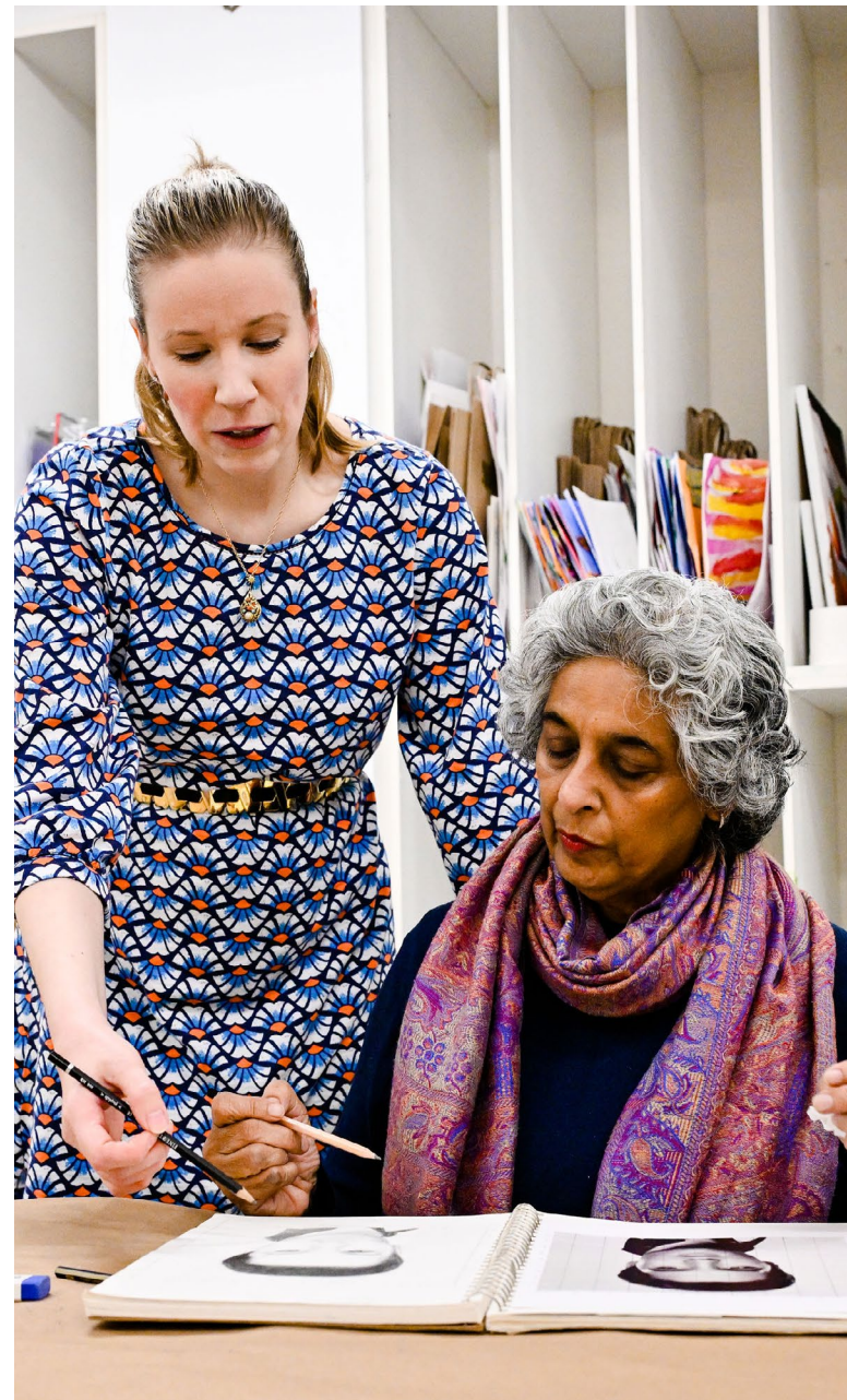
Dollard Centre for the Arts

This first cultural policy was developed, through a rigorous process, by the persons responsible for culture and recreation at the City, with the support of ArtExpert. The process began with establishing the sociodemographic profile of the population and a complete review of the current cultural offerings. These steps made it possible to analyse and identify the key issues and challenges specific to Dollard-des-Ormeaux. A public consultation with stakeholders and citizens enriched this analysis and helped establish the groundwork for the desired actions to structure and improve the cultural offerings. A follow-up committee , made up of key community members, closely monitored the successful completion of the process. Dialogue with the committee enabled us to remain current on the realities specific to Dollard-des-Ormeaux and align the vision for future development of cultural offerings with the needs expressed.